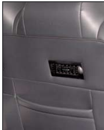
Conveniently located air vents for individualized passenger comfort.