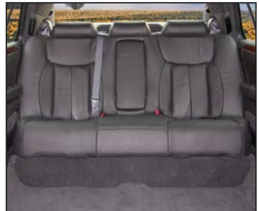
Low profile floor provides the greatest headliner-to-floor clearance. Don't be confused by competitive "flat floor" models that actually raise the floor.