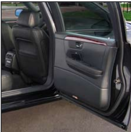
Widest-opening doors available.