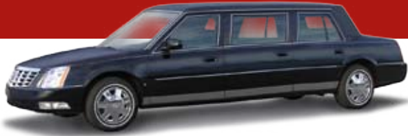
47-inch Cadillac Commercial Glass Six-Door Limousine

No matter which model you choose, S&S provides the ultimate in passenger comfort. Air vents are ideally positioned to provide maximum climate control for all rear compartment passengers. For added convenience, a tissue dispenser is strategically located for rear seat passengers.