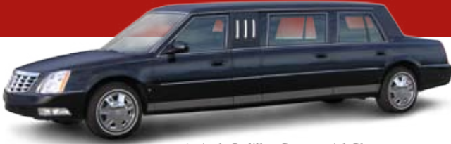
65-inch Cadillac Commercial Glass Six-Door Limousine