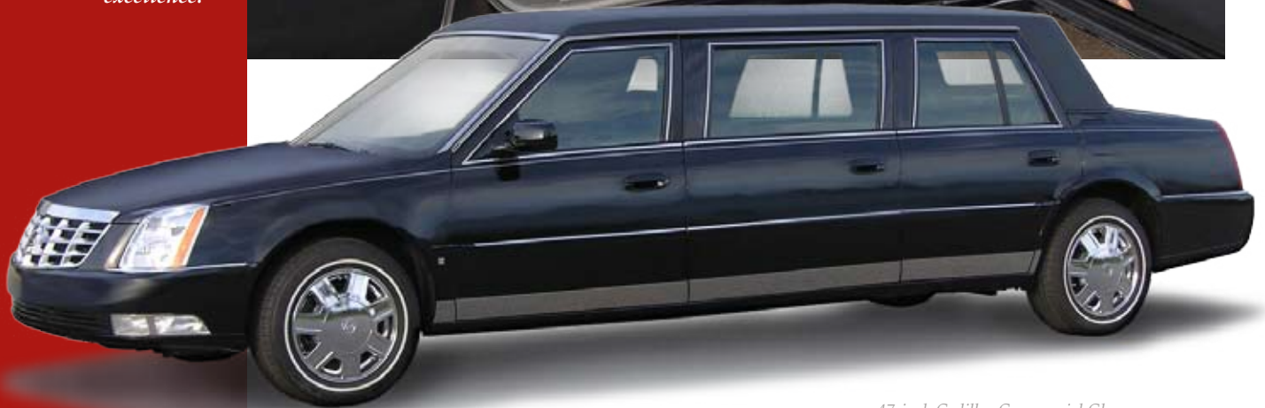
47-inch Cadillac Commercial Glass Six-Door Limousine

Your image is paramount to S&S. Every professional car we develop is designed with you in mind. S&S was the first to give you a standard 47" wheelbase extension. S&S was the first to give you a Commercial Glass limousine