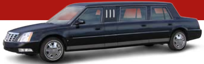
65-inch Cadillac Commercial Glass Six-Door Limousine