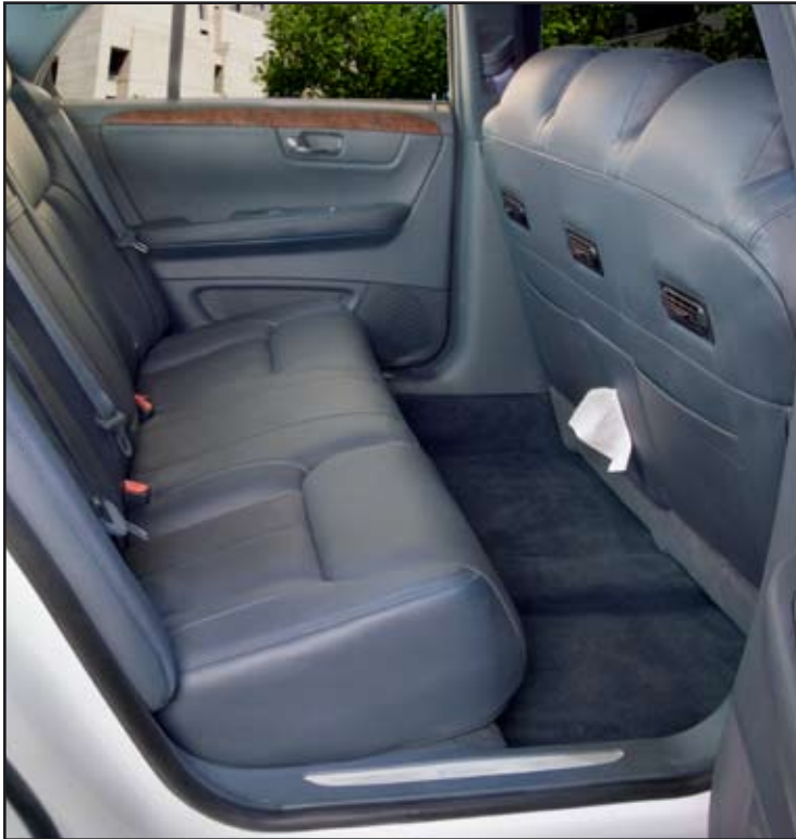
Center seat design provides additional foot room for rear seat passengers.

No matter which model you choose, S&S provides the ultimate in passenger comfort. Air vents are ideally positioned to provide maximum climate control for all rear compartment passengers. For added convenience, a tissue dispenser is strategically located for rear seat passengers.