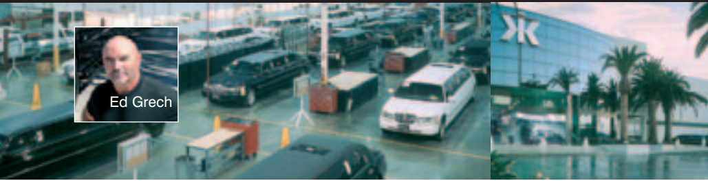
Krystals' state of the art facility in Brea