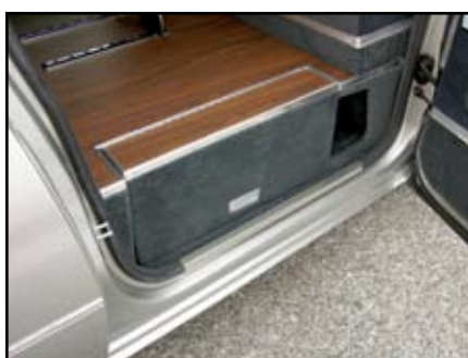
Optional flip-up lid for church truck compartment.