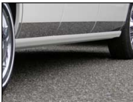
Optional lower chrome molding.