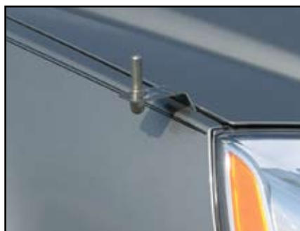
Optional flag staff posts