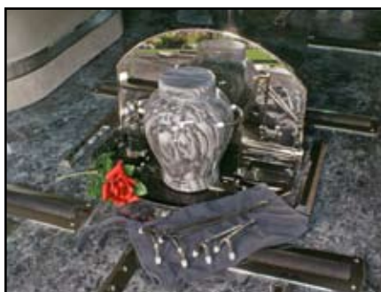
Optional Hidden Gem in-floor urn carrier.