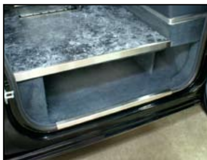
Optional closed church truck well.