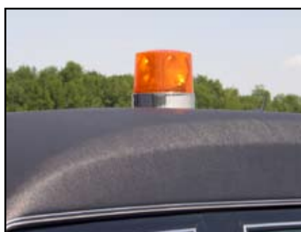
Optional beacon ray roof. Wiring for a customer-provided light can also be installed.

Due to continuous improvement, Accubuilt reserves the right to change standards and specifications without notice or price adjustment.