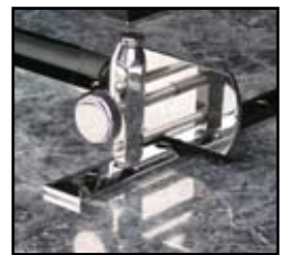
Bier Pin in position.