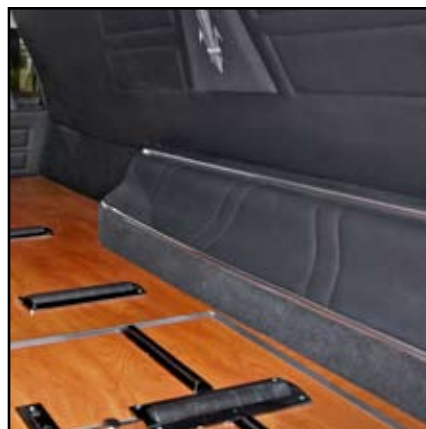
Scuff-resistant wheelhouse panels are accented with brushed aluminum moldings.