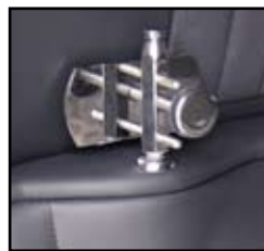
...it can be conveniently stored on the top of the wheelhouse panel.