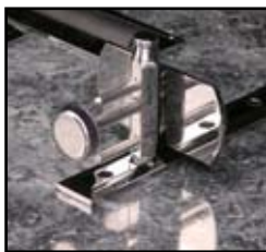
Bier Pin fully open.