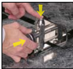
Depress the top button and push the knob until the bier plate is close to the casket or Commemorative Carriage.