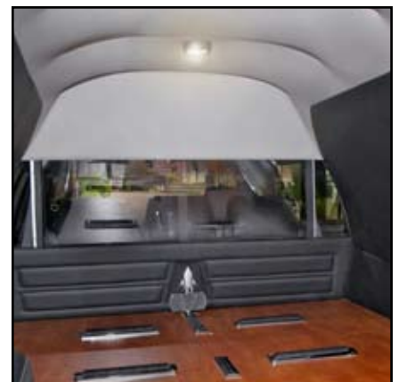
A lighted, elegant casket space.