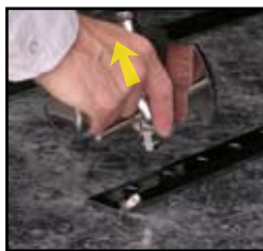
Grasp and pull the Bier Pin straight up from its seated position and...