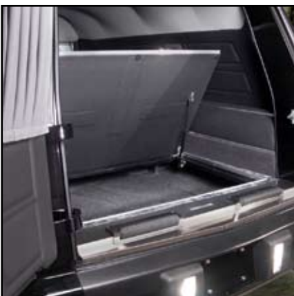
Rear-floor compartment with full-size spare tire storage.