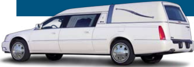
◀ Shown with optional stainless-steel band and padded motif