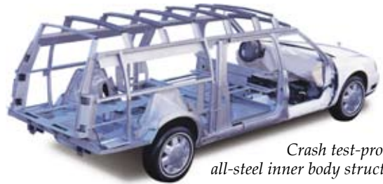
Crash test-proven, all-steel inner body structure.