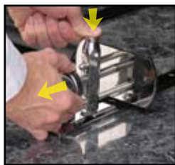
To release, simply push the top button as before, and pull the knob to open the pin.