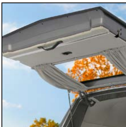
Optional hatchback load door.