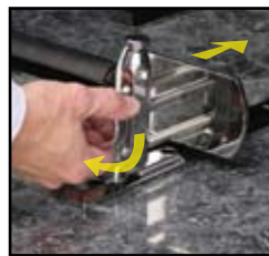
Tighten the quick-adjust knob to secure the casket or Commemorative Carriage in place.