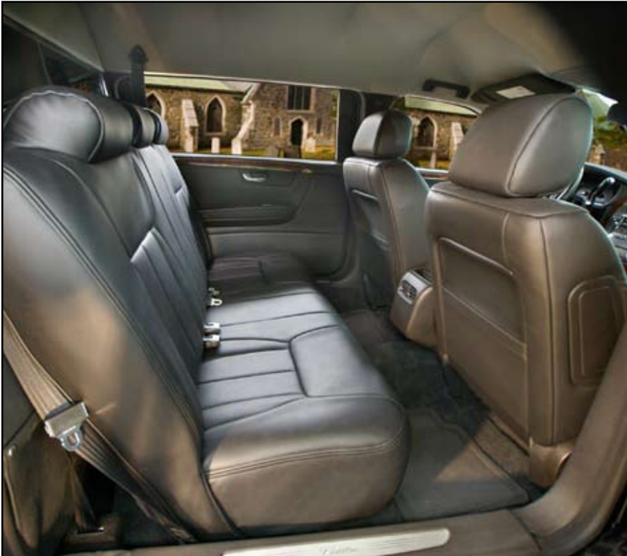
The Statesman L6 provides plentiful leg room for rear-seat passengers.