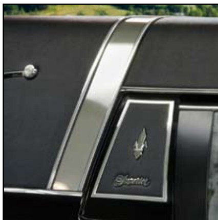
An optional stainless-steel roof band and padded motif panel are available together or separately.