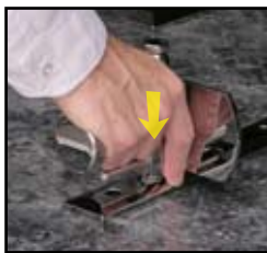
Place the Bier Pin in one of the hexagonally-shaped holes.