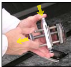
Depressing the top button releases the tightening knob and shaft to fully open the Bier Pin.