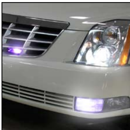
A number of light and strobe options are available including the wig-wag flashing headlights and purple cornering strobes shown above.