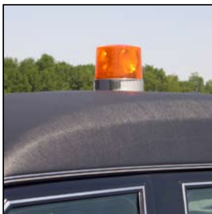
An optional beacon ray light as pictured, or wiring for a customer's light can be installed, if requested.